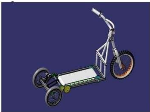
FIGURE 7 3D DESIGN OF BICYCLE

If the belt was shifting away from its centre while it was resting on its rollers, this resulted. As soon as we start using the treadmill, the back wheel will begin to move, which will cause the flywheel to build up momentum. Once the flywheel has gained initial momentum, the bicycle will continue to go forward due to the momentum that is created by the flywheel. In addition to that, we used a gear system to attach a dynamo to the rear wheel of the vehicle. As a consequence of this, the dynamo spins and generates electricity each time you use the treadmill. This power can then be stored in a battery and used at a later time. The design model can be seen in Fig.7.