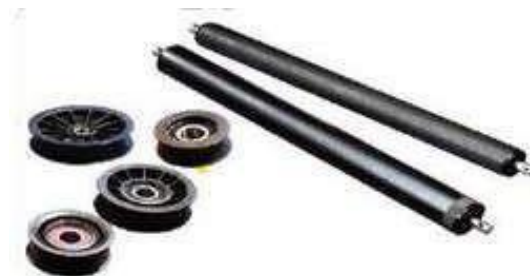
Figure 3. Rollers

Even if the bicycle does not go forward when being ridden on bicycle rollers, which are a specialist sort of bicycle trainer, it is nevertheless feasible to ride a bicycle indoors using these devices. As may be seen in Figure 3, Because rollers, unlike other forms of bicycle trainers, are not attached to the frame of the bicycle in the same manner that other types of bicycle trainers are, the rider needs to be able to keep their balance while exercising on the rollers.[7] The rider of the bicycle moves forward and backward on top of the bicycle rollers, which normally come in sets of three for the front wheel. Because one of the back rollers is connected to the front roller of the bicycle through a belt, the movement of the pedals on a bicycle will cause the front wheel to spin when the bicycle is being ridden by a human. In most cases, the spacing between the rollers of a bicycle can be adjusted to correlate with the length of the wheelbase of the bicycle. The front roller will typically be adjusted in such a way that it is positioned some distance in front of the hub of the front wheel. This is the case in the majority of cases. [11-13]