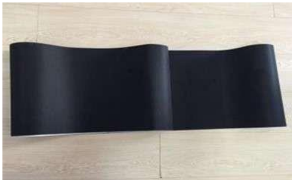
FIGURE 1 TREADMIL BELT

The augmented width will enable individuals to sway without encountering any obstructions from the frame, while the augmented length will allow for jogging with a normal stride without the potential hazards of tripping or falling off the treadmill.