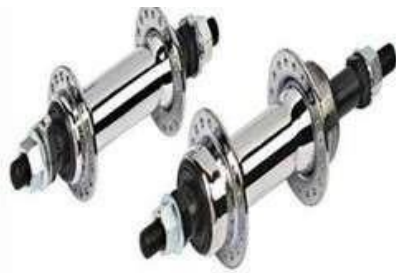
FIGURE 4. BEARINGS

The bearings are held in place by a bearing block that is a part of it. Cast iron is the material that is used to produce it . Every bearing that is made use the machine frame in some way. [14,15]