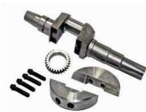
FIGURE 5 FLYWHEEL

The term "flywheel" refers to a rotating mechanical device that is employed for the purpose of storing the energy that is generated by rotation. Flywheels have something called the moment of inertia, which gives them the ability to withstand changes in the speed at which they are turning.[9] The amount of potential energy that may be collected from a flywheel is proportional to the cube of its spinning speed. When a torque is applied to a flywheel, the flywheel's rotational speed increases, and the quantity of energy that the flywheel stores as a result of this increase is increased. On the other hand, a flywheel makes use of speed in order to release energy that has been accumulated. [16,17]