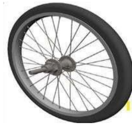
FIGURE 2 WHEEL

The requirement that the wheel must have a moment applied about its axis in order for it to circle can be met by gravity or by the application of some other external force or torque, but only one of these possibilities can meet the need.[6] In a single statement, the outline can be summed up as follows: "the outside edge of a wheel will be retaining the tyre." When applied to vehicles such as automobiles, it will produce the outer circular design of the wheel on which the inner edge of the tyre is fixed. This design may be seen from the outside of the vehicle. Because of this, the vehicle will be able to travel with less resistance. A large hoop, for instance, is the component of a bicycle wheel that is exposed to the outside and is attached to the extremities of the spokes. The bicycle's tube and tyre are both housed within this section of the wheel of the bicycle. [8-10]