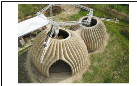
Tecla 3D printed house [3]