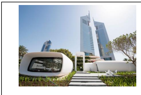
Office of the Future, Dubai. [1]