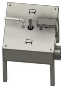
Figure 1: - 3D model of Auto cleaning centrifuge system

Proposed automated system for cleaning centrifuge consists of the upper plate, housing, centrifugal pot, shaft, scraper, actuator, pneumatic cylinder and coupling done inside the pot.