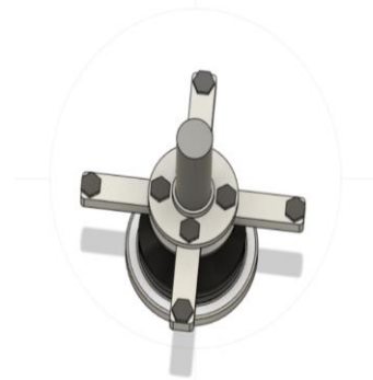
Figure 4: - Coupling

A coupling is a mechanical element/part that connects two shafts together to transmit power from the drive side to the driven side. The need of coupling in the device is to rotate the pot with the help of the motor which is mounted on the upper end. The coupling used in the device is a standard sized flange coupling with Internal Diameter of 30mm. The coupling attached will be bolted by using M10 type of bolts.