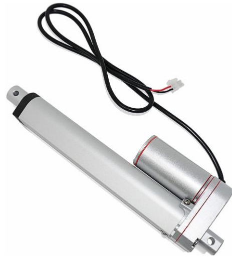
Figure 2: -Linear actuator [10]

Linear actuator are the ones that converts rotational motion into linear motion. The movement of the actuator can be powered by the use of Hydraulics or Pneumatics.