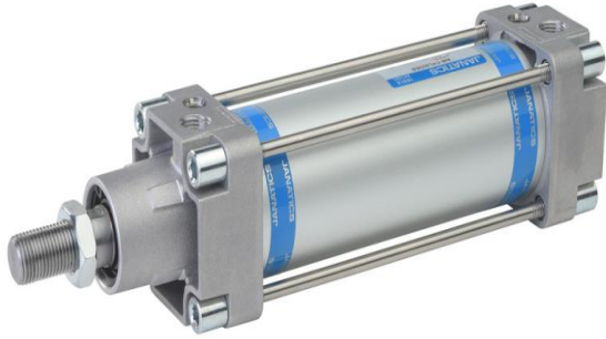
Figure 3: - Pneumatic cylinder [9]