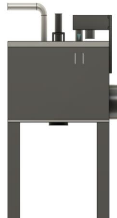
Figure 6: - Design of the centrifuge

Working: In this solution, scraping mechanism is included for easy removal of sludge. In this solution, when the maximum level of sludge is reached, the oil flow from inlet will be ceased temporarily. Then the actuator will move down the arm to which the scraper is attached. The pot will be allowed to rotate at a certain RPM. This will ensure that all the sludge stuck on the inner walls of the pot is removed properly. Simultaneously, the lower cork will open with the help of pneumatic cylinder. As the lower end is opened, the sludge will fall with the help of gravitational force. As the sludge is excreted completely, the lower cork will again close the opening of the pot and the filtration process will be continued again.